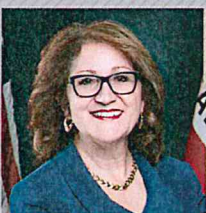
THE HONORABLE ELOISE GÓMEZ REYES 47 th Assembly District