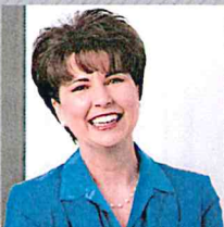
THE HONORABLE CONNIE M. LEYVA 20 th Senate District